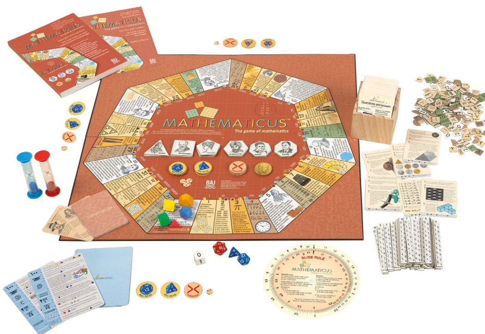
Instruction booklet (24 pages) and book (176 pages).